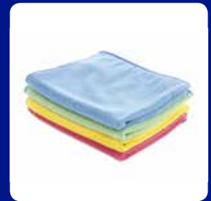
ULTRASILVER GENERAL PURPOSE HAND CLOTH #60370