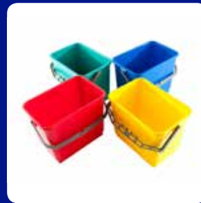
4L HAND CLOTH PAIL #63360